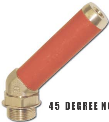
45 DEGREE NOZZLE