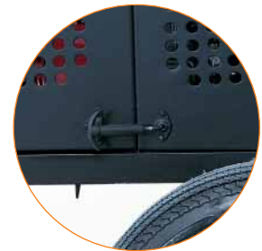
An engine shroud of heavy gauge steel provides protection and safety during operation and transport. Reinforced steel latches ensure long life and positive engagement.