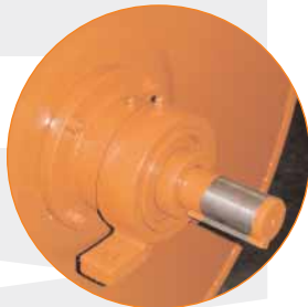
A cast iron trunnion and pillow block house a triple seal protection system utilizing both rigid steel washers and flexible synthetic grease seals. This system provides for protection from contamination and premature failure.