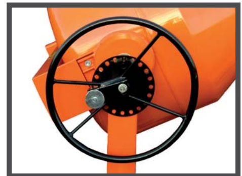
WHEEL MECHANISM FOR ADDED CONTROL