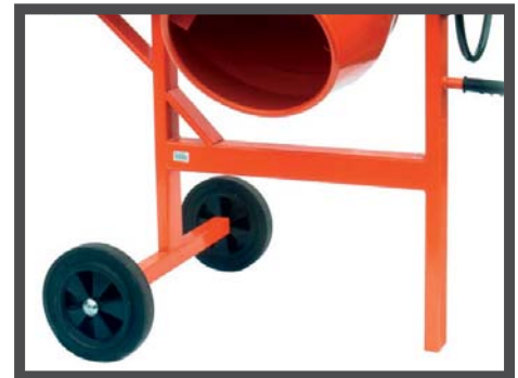
HEAVY DUTY STAND