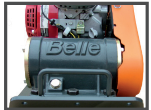
11KN VIBRATION UNIT & FRONT LIFTING HANDLE