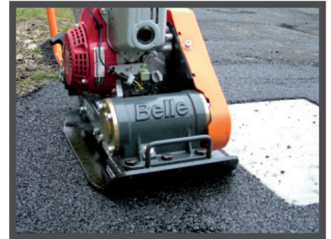
IDEAL FOR 'PATCHING'